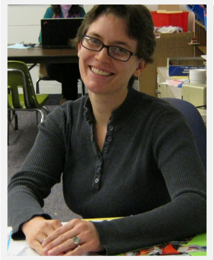
LEI's first Volunteer of the Month!

her emotions, enjoying creating characters to work through her feelings. Her favorite novel is George Eliot's Middlemarch , which weaves together a complicated romance and the socioeconomic elements of 19th century England.