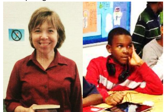
Patti Smith is cooler than the rock star with whom she shares a name.